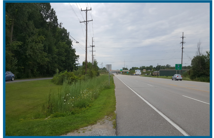
Gratiot Road north shoulder, west of I-94.

Last summer, SEMCOG awarded a $159,500.00 Transportation Enhancement Program (TAP) grant to St. Clair County to construct a paved trail along the north side of Gratiot Road in Kimball Township from the I-94 Park N Ride, under I-94 to Pickford Road. This fall, Project Control Engineering of Clay Township developed construction plans and specifications for the trail. Construction of the trail is expected to start in the summer of 2018. The project is the first phase of a plan to connect the Bridge to Bay Trail to the Macomb Orchard Trail in Richmond. In turn, the trail will be part of the Great Lake to Lake Trail running from the City of Port Huron to the City of South Haven.